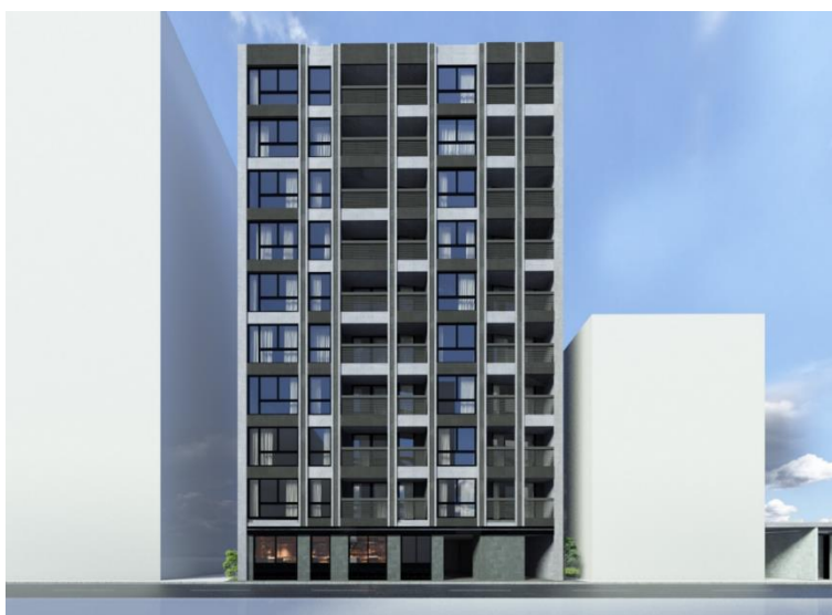
FLUFFY Nihonbashi Hamacho

2 FLUFFY is a pet-symbiotic rental housing complex built on the premise of comfortable living with pets, creating and providing a pet-friendly experience through hardware (dedicated facilities) and software (support system for residents and their pets).